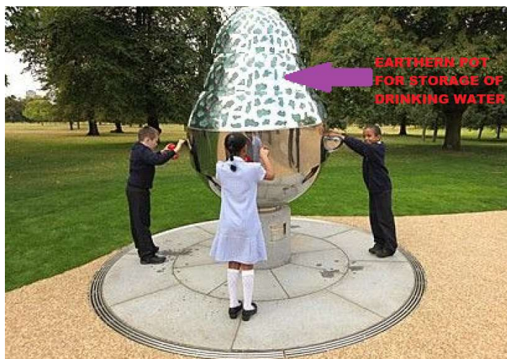
An Illustration of Drinking Water Point