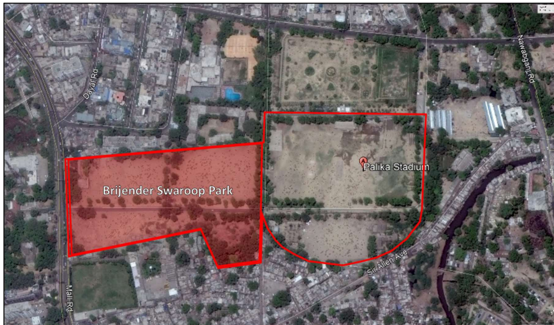
Site Location Map of the Project

Indoor Sports Complex project is aimed at developing the under-utilized open area of Brijendra Swaroop Park and enhancing the sport infrastructure of existing Palika stadium; and generating a revenue model to financially sustain the proposed sports complex facility.